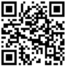
Invest via Website

TOTAL COST: A pledge of $28,800 lump sum or $2,400 per month.